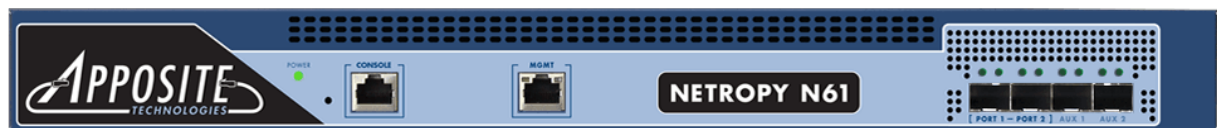
Optional SFP Interface Version

The front panel of the Netropy N61 contains: